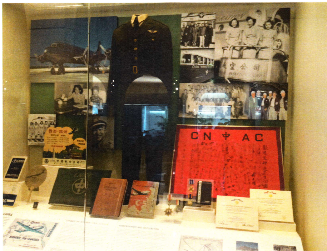
One of the amazing Legend of CNAC displays created by the SFO Museum staff.