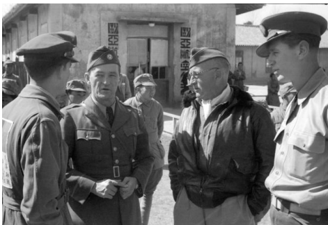
Gen. Chennault during the war

As the fiasco rolled on, the US warned Britain that bilateral relationship would be damaged if the planes were to fall into communist hands. Ultimately the British yielded to US pressure as they too were dragged into the Korean War. The colonial government succumbed to intrigues of a US-sponsored Nationalist government in Taiwan, in collaboration with Gen. Chennault of Flying Tiger fame. In 1952 Chennault finally acquired the remaining planes under CAT (Civil Air Transport), an airline which later became Air America, a proxy operation for the CIA.