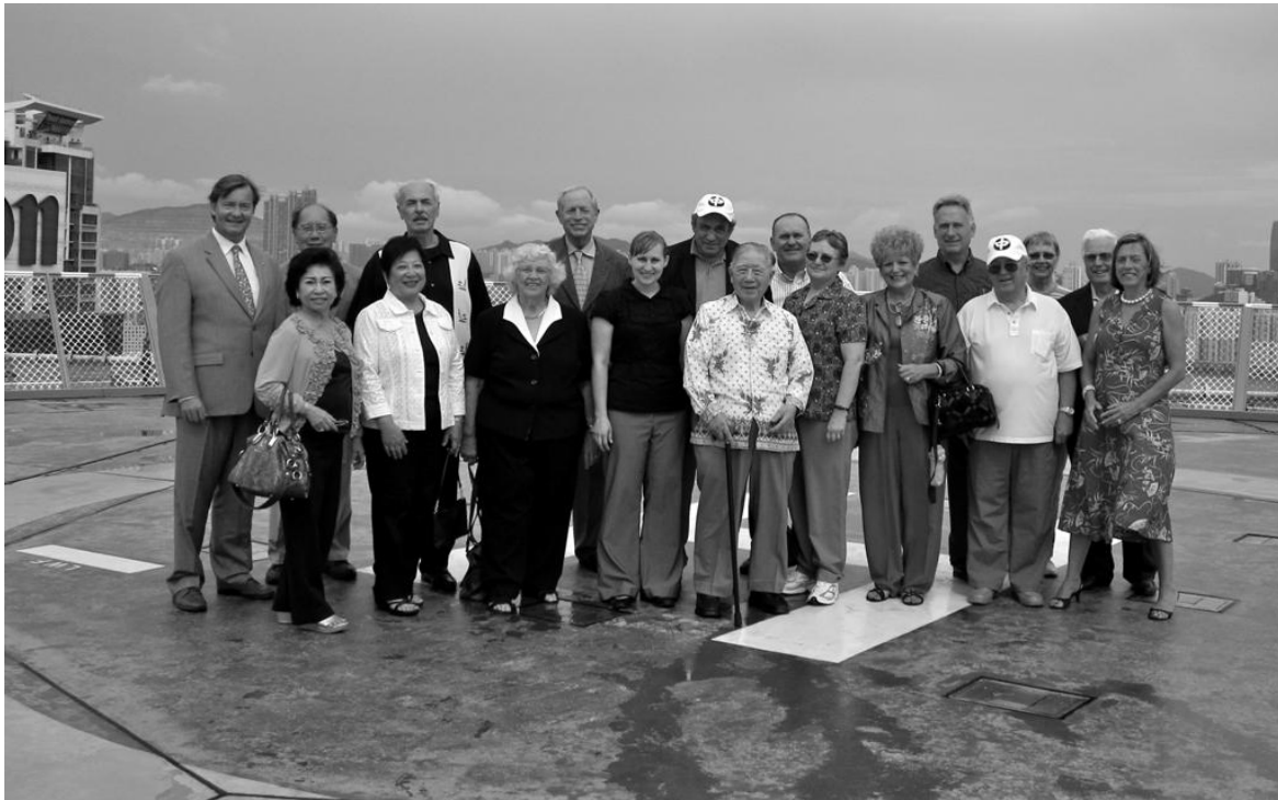
CNAC Association trip to China The Peninsula Hong Kong September 14, 2010