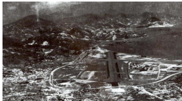
Kai Tak runway in early days

For those who defected or heroes of an uprising, depending on the viewpoint, some were inducted into the fledging Chinese Air Force. Others continued to serve in its budding civilian airlines. In all, over 2500 staff members of the two airlines, CNAC and