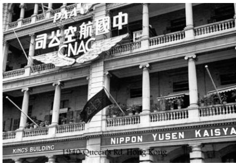
CNAC Queen's Road Office

Between 6am and 8am, twelve airplanes of CNAC (China National Aviation Corp) and CATC (Central Air Transport Corp) were to take off from Kai Tak runway and headed north, landing in Beijing and Tianjin within a few hours. To most people at the time, these pilots and crew defected with their planes to the communists. To others of the young PRC, these were heroes in an uprising, bringing their planes back to the arms of the motherland. Mao was to hand-script a letter of commendation to all the crew members three days later. Twelve airplanes descended from heaven were like a godsend in those early days of the PRC. Sixty years have passed since that tumultuous day when the world watched in awe as one of the largest aviation fleets defected en masse.