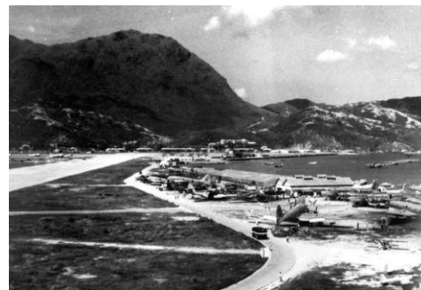
Kai Tak Airport in 1949