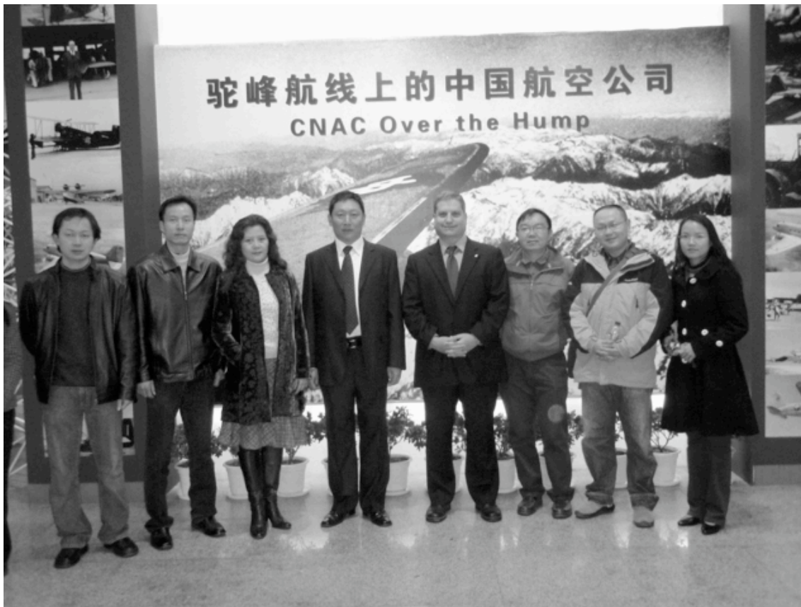
KUNMING MUSEUM EXHIBITION OPENING DAY JANUARY 20, 2009