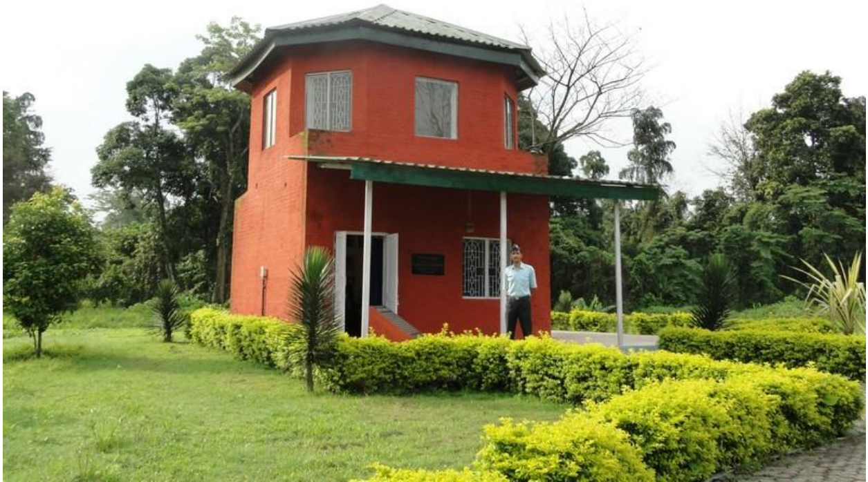
The old ATC building