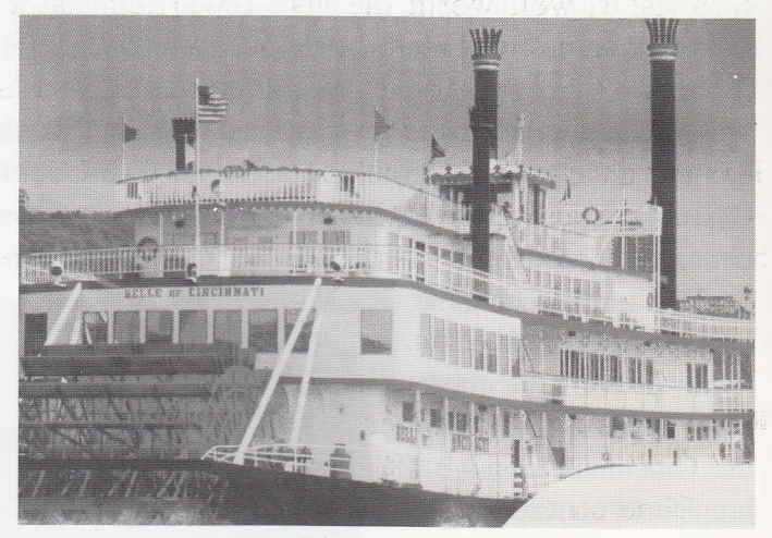
Cincinnati's Paddlewheel Riverboat