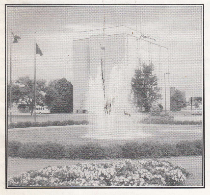
Cincinati-Northern Kentucky Airport Radisson Story, Page 3