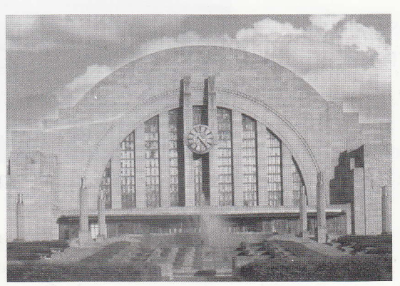
Cincinnati's Museum Center

Don't miss seeing the nation's largest WW II retrospective,"Cincinnati Goes To War," featuring the Cincinnati area's homefront contributions to the war effort. Enjoy a recreation of the city's 1850's Public Riverboat landing, complete with an authentic 94 foot side-wheeler.