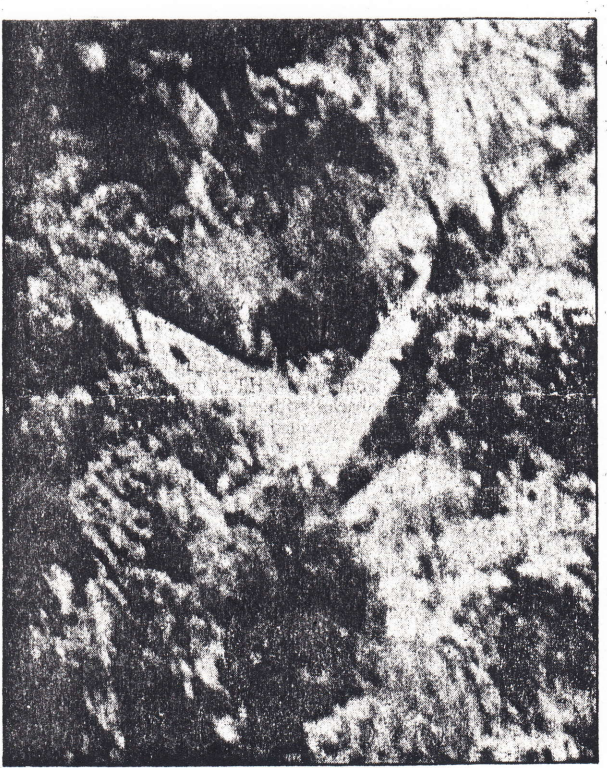
A photograph of the airplane shows it crash-landed intact, but no trace of the crew has been found.

of Egypt and the vegetation of South America. "They came to us," Elachi said.