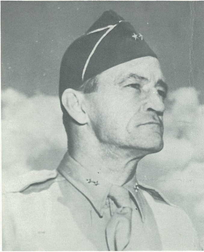
Gen. Claire Lee Chennault