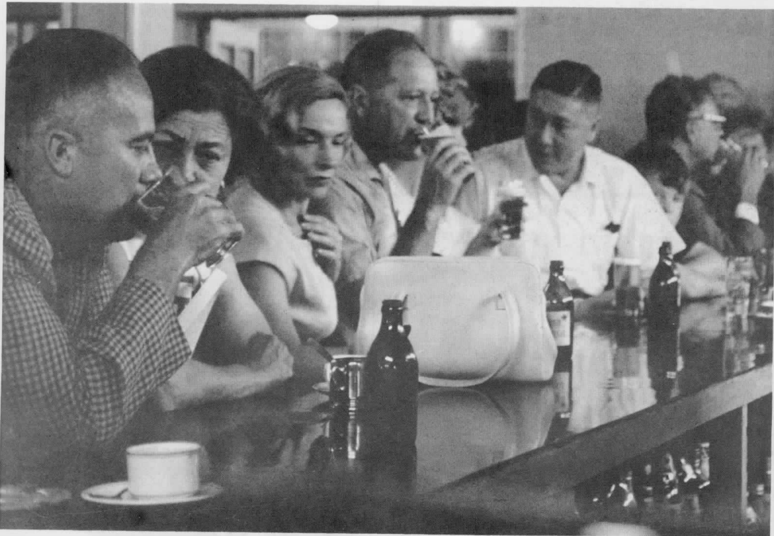
STOP FOR REFRESHMENTS AT SANTA MARIA, ON WAY OVER.