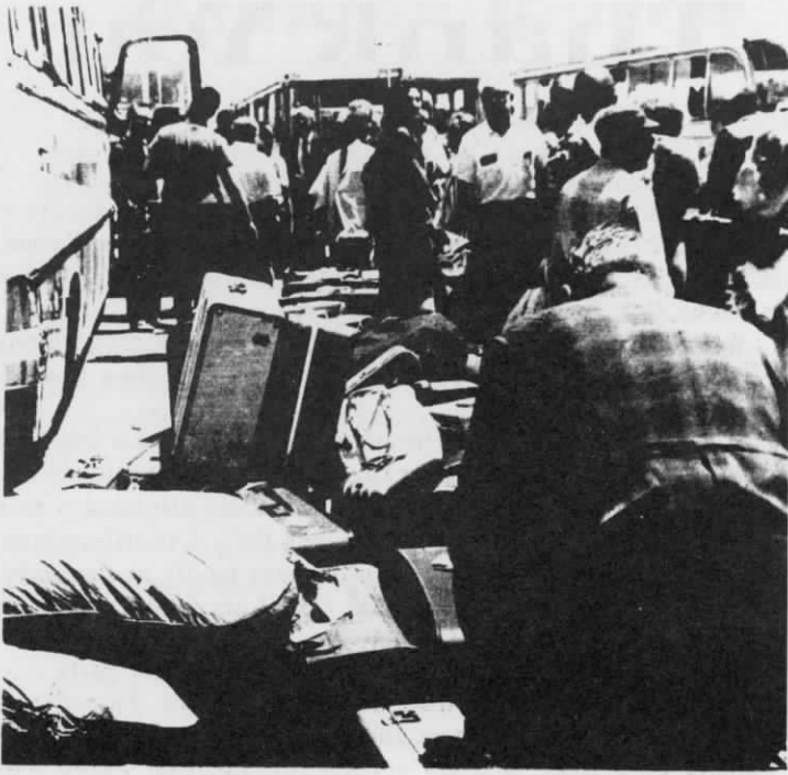
GARBLED GARMENT BAGS. Piles of baggage awaits sorting on arrival.