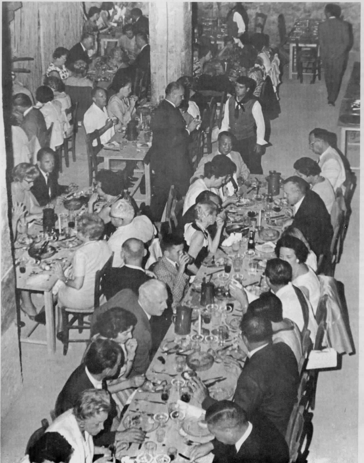
Dinner at Los Termes