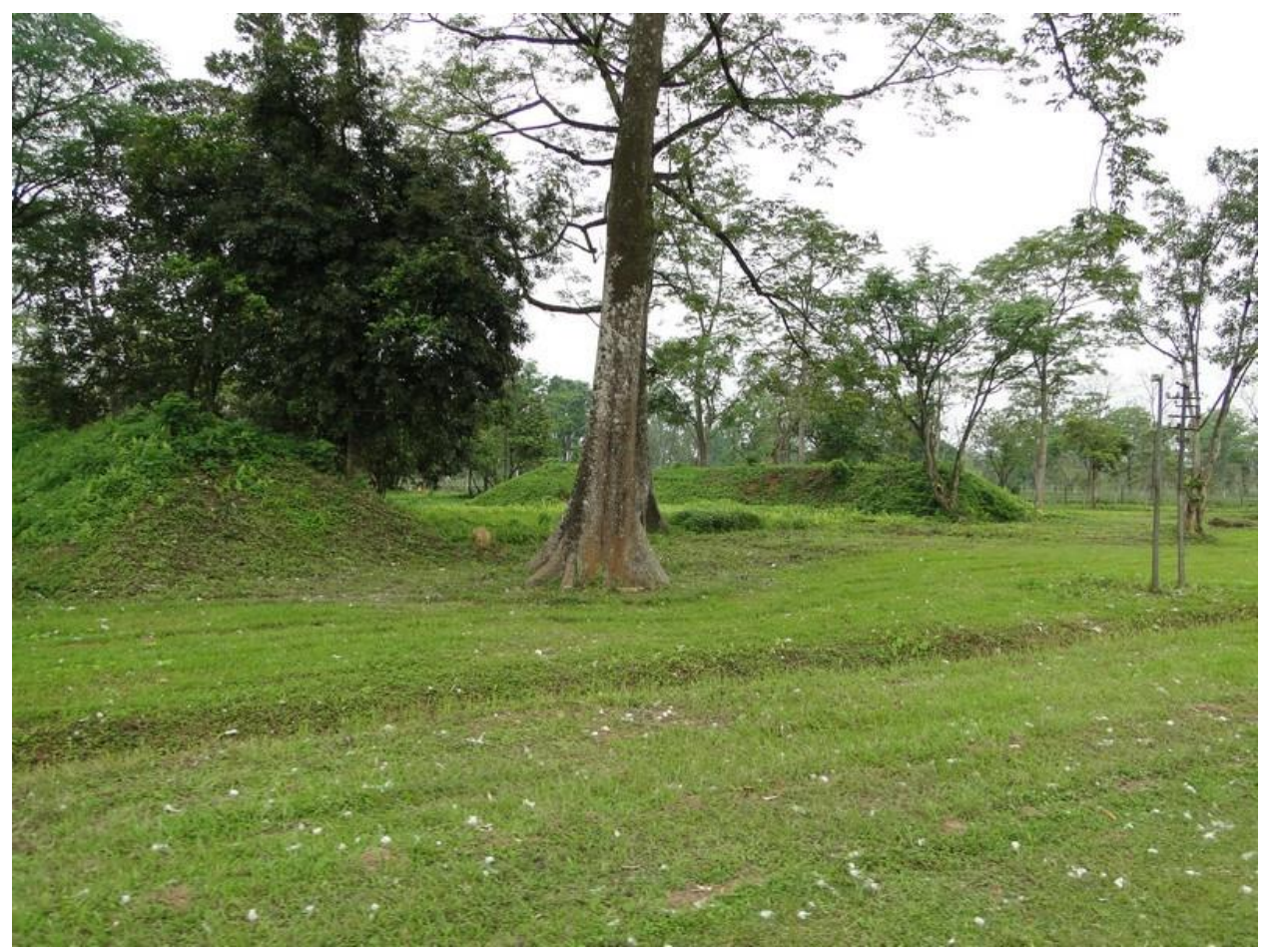
Thats all that remains of the blast penns.

Thank you for the wonderful memories. We salute your bravado.