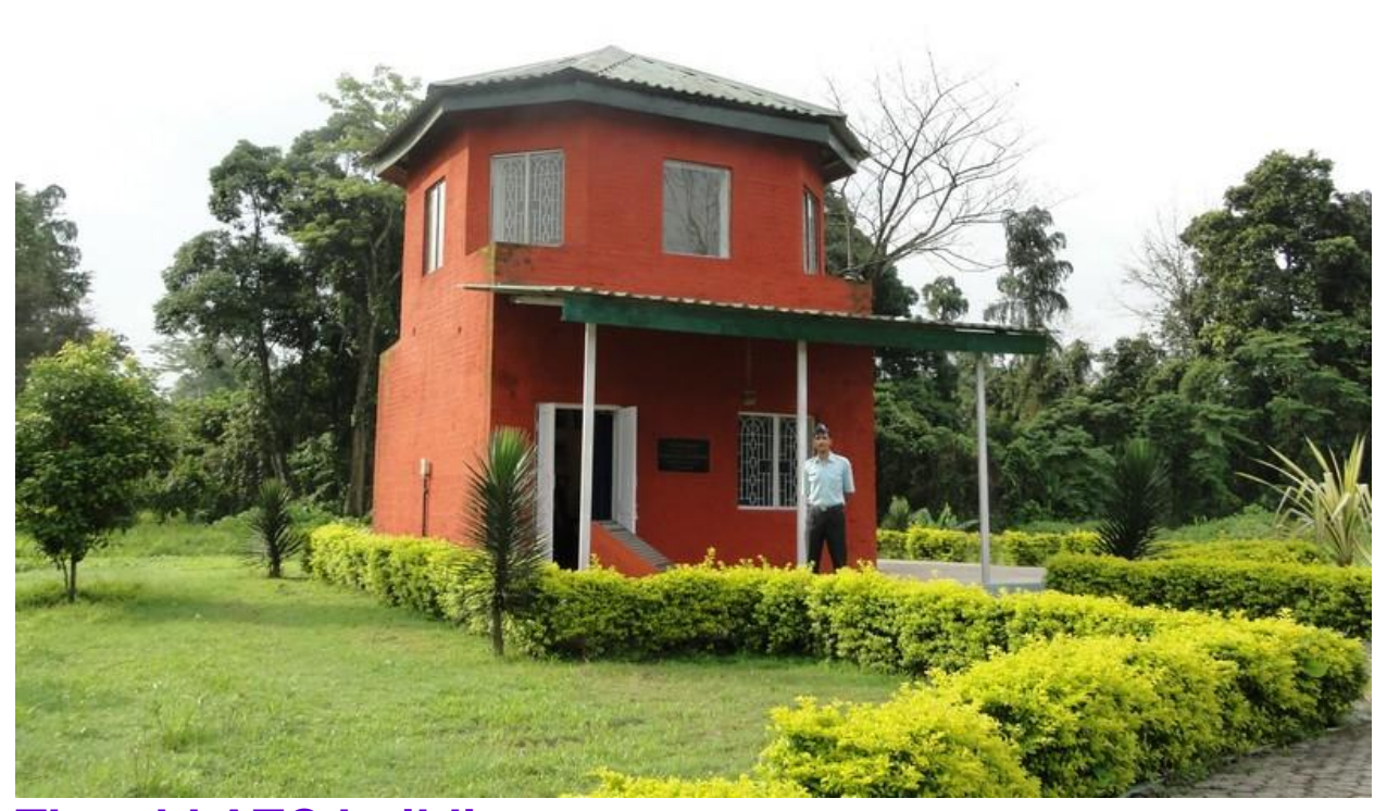
The old ATC building