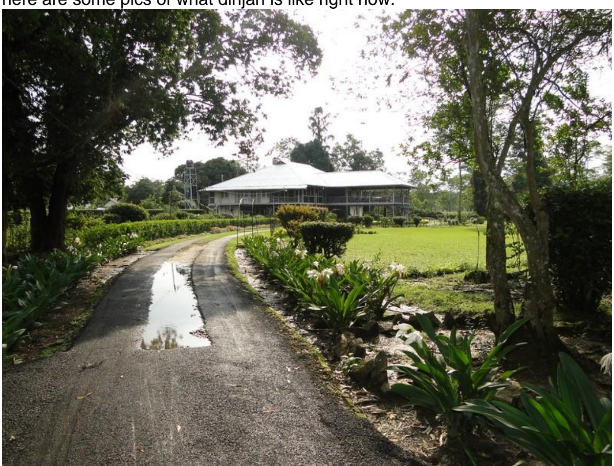
The CNAC bungalow. I took some time locating it.

here are some pics of what dinjan is like right now.